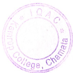
Coordinator Internal Quality Assurance Cell Kamrup College, Chamata